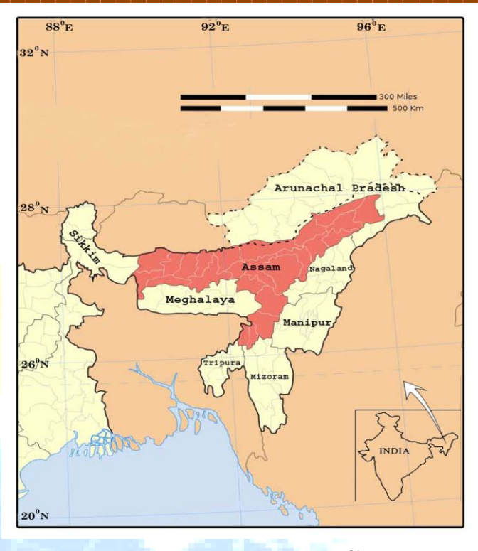
Figure 2: Location of the study area <sup>39</sup>.